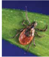
Female Deer Tick

American dog ticks can carry the bacterium that causes Rocky Mountain spotted fever. Dog ticks are reddish-brown and larger than deer ticks. Deer and dog ticks are most active during the spring, early summer and fall.