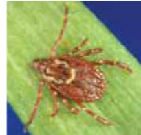
Female American Dog Tick

Lone star ticks are becoming more common in New York State. They can carry the germ that causes human monocytic ehrlichiosis and another rash illness that has been seen in over 20 other states. Adult female lone star ticks have a white dot on their back and are similar in size to deer ticks. They are most active from April through July.